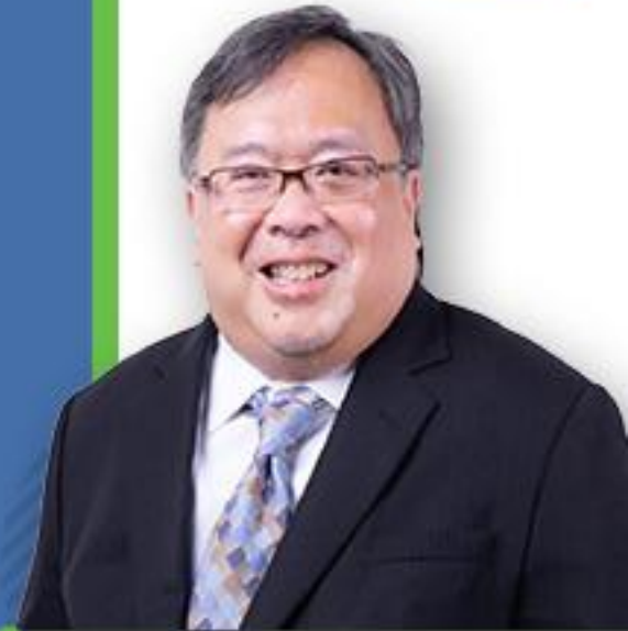
Prof. Bambang Brodjonegoro, Ph.D

IETD plays a crucial role as a hub for information and tactics promoting a more sustainable and renewable future. This year's focus on Refining Indonesia's Just & Orderly Energy Transition, the dialogue will bring in a range of knowledgeable and experienced individuals to provide their perspectives on the obstacles and opportunities facing Indonesia as it prepares for the energy transition. Navigating newfound risks and complexities as global technology, politics and economics evolve is important in seeing Indonesia's readiness to face the challenges of the energy transition. Obviously, if sustainable industrial growth, ecological resilience, and community welfare are given top priority during the energy transition, Indonesia can be empowered from the middle-income trap.